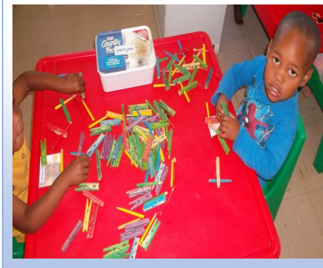
Fine motor development with pegs and pencils