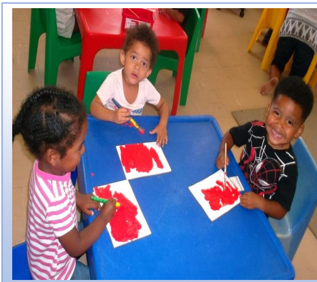
2 - 3 year olds — painting