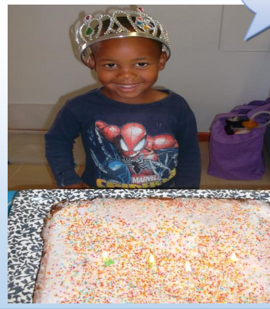
Tatum turned 4