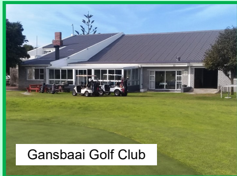
Gansbaai Golf Club

Then visit the BARC Stall at the GANSBAAI FARMER'S MARKET behind the municipal buildings between 9:00 to 12:00. Wonderful creative, affordable home made merchandise will be on sale. Scratch poles, animal toys, dog biscuits, doggie bow ties and much more. Come spoil your pet and assist with BARC funding. As these markets are now postponed, BARC is under severe financial constraints so please see how you can contribute on page 5.