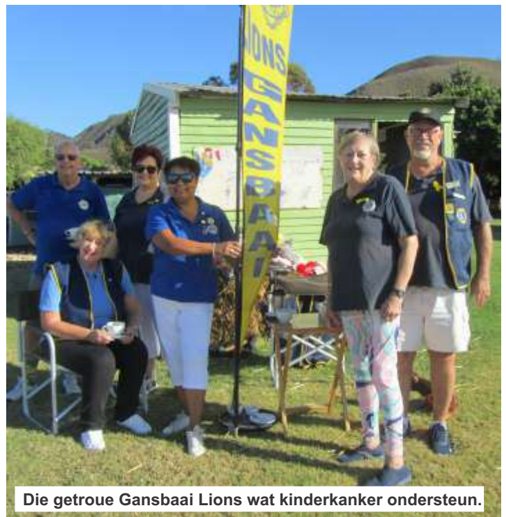
Die getroue Gansbaai Lions wat kinderkanker ondersteun.