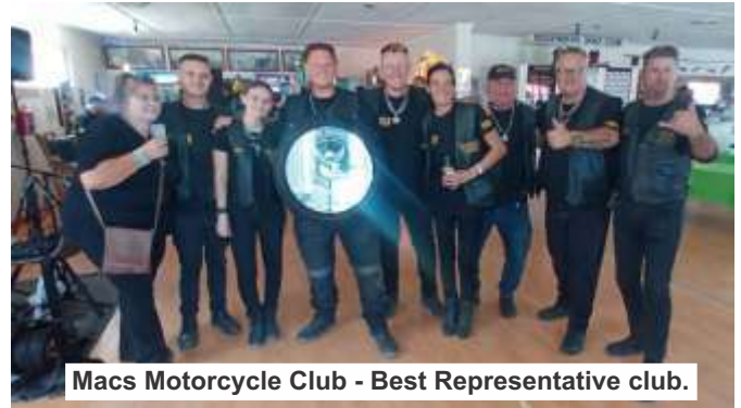
Macs Motorcycle Club - Best Representative club.

and food for charity organisations and they planned to collect more during the rally. "We were very friendly welcomed in Gansbaai," he said. Like many motorcycle clubs of which the Gans-Berg News have reported on, for these men and women Rallies are not just about the pleasure of touring with the motorcycles. Their primary purpose is charity, and these club members