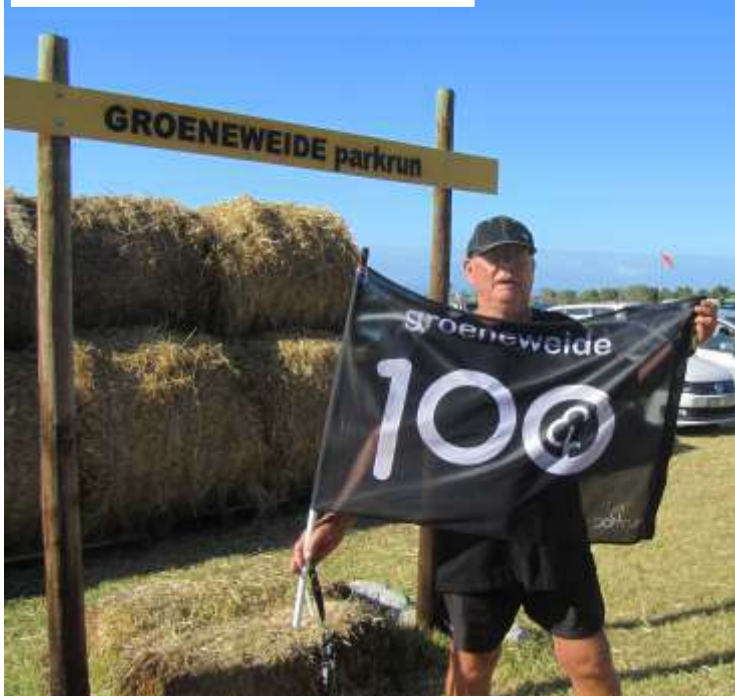
Die trotse foto-plek vir 100ste parkruns.