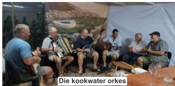
Die kookwater orkes