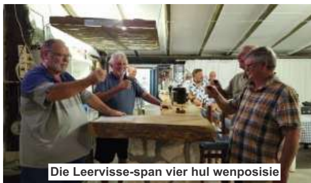
Die Leervisspan vier hul wenposisie