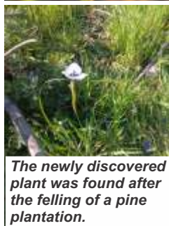
The newly discovered plant was found after the felling of a pine plantation.