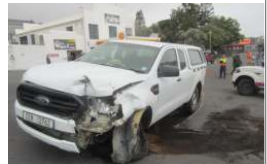
Die erg-beskadigde Ford Ranger bakkie