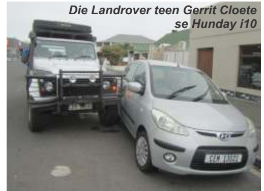
Die Landrover teen Gerrit Cloete se Hunday i10

"Toe is daar sowaar 'n botsing!"