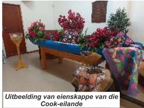
Uitbeelding van eienskappe van die Cook-eilande

"Jaarliks kry verskillende lande 'n beurt om die program saam te stel en vanjaar is dit deur die vroue van die Cook-eilande opgestel." Tradisies van daardie vroue word dan ook uitgebeeld.