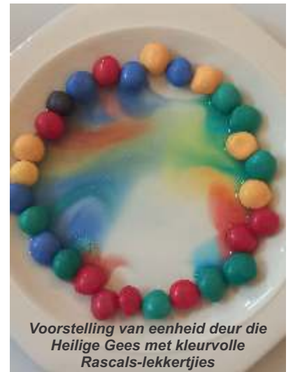
Voorstelling van eenheid deur die Heilige Gees met kleurvolle Rascals-lekkertjies