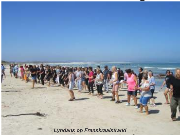
Lyndans op Franskraalstrand