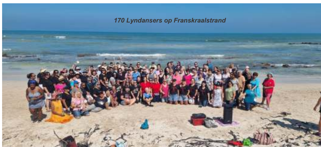
170 Lyndansers op Franskraalstrand