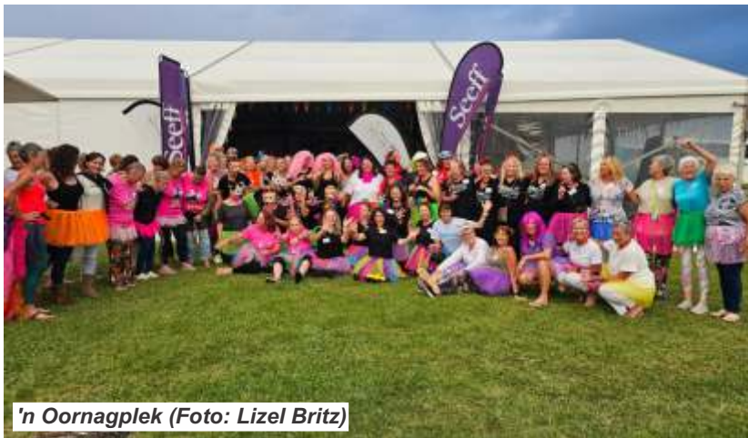
'n Oornagplek