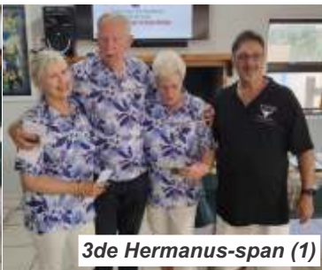
3de Hermanus-span (1)