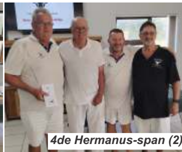
4de Hermanus-span (2)