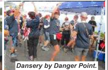
Dansery by Danger Point.