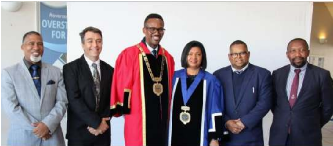
Nuwe Burgemeesterskomiteelede aangekondig:

“News that speaks to you. From breaking stories to inspiring features - everything you need, every day.”