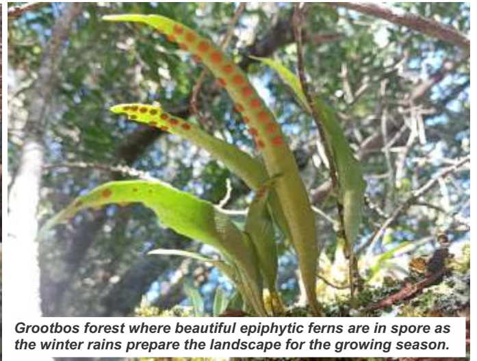
Grootbos forest where beautiful epiphytic ferns are in spore as the winter rains prepare the landscape for the growing season.