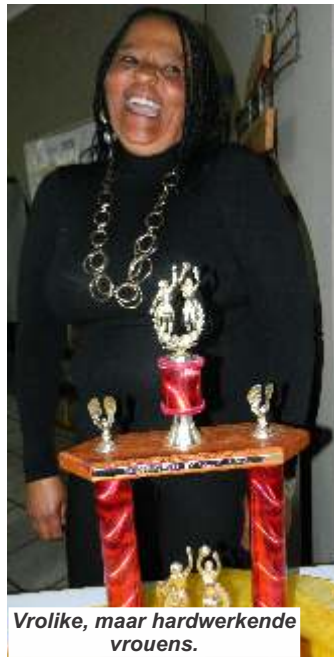
Vrolike, maar hardwerkende vrouens.