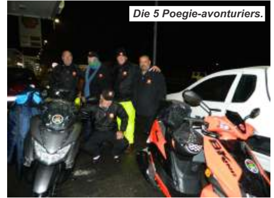
Die 5 Poegie-avonturiers.

Nou-ja, alle bekendes, insluitend die Redaksiespan van die Gans-Berg Nuus, wens hierdie 5 manne net die beste toe, asook 'n veilige rit - 'n uitdaging is dit gewis, maar hulle is