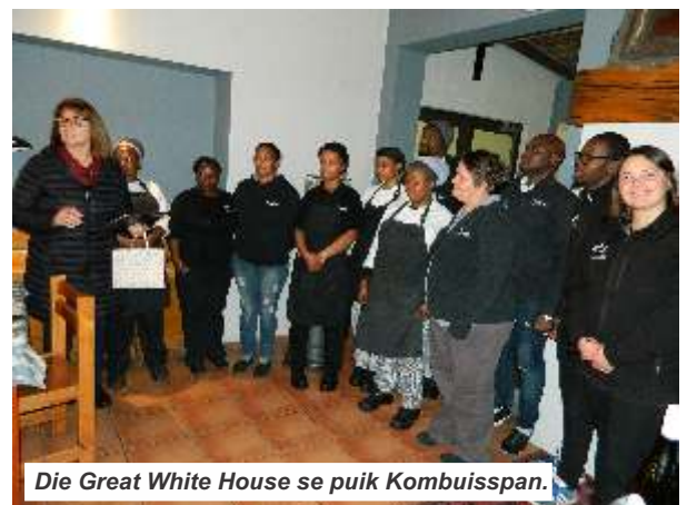
Die Great White House se puik Kombuisspan.