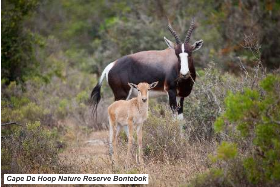
Cape De Hoop Nature Reserve Bontebok

The 2025 State of Conservation Report highlights the progress and priorities in protecting Western Cape biodiversity. CapeNature launched the 2025 State of Conservation Report on 26 June 2025 at its annual Conservation Review, offering a clear, evidence-based view of the Western Cape's biodiversity and how conservation efforts are measuring up.