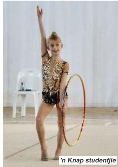
'n Knap studentjie