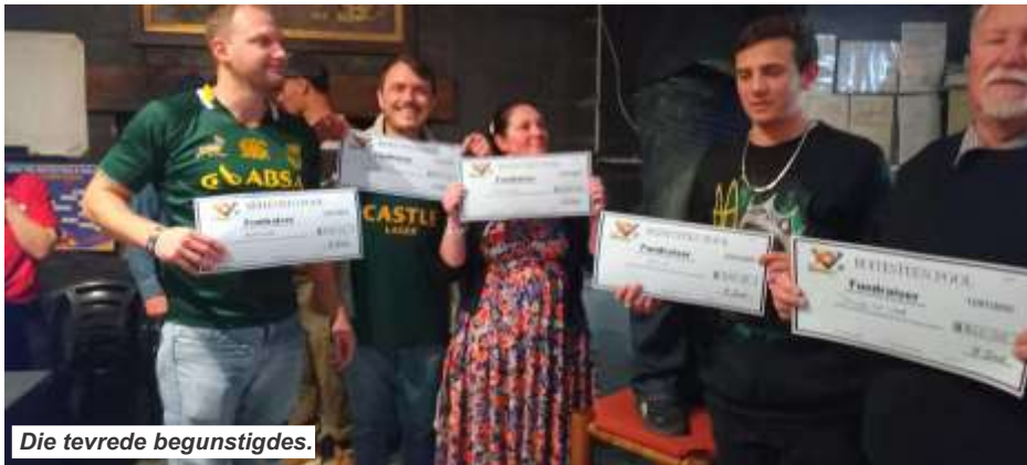
Die tevrede begunstigdes.