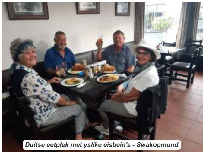
Duitse eetplek met yslike eisbein's - Swakopmund.