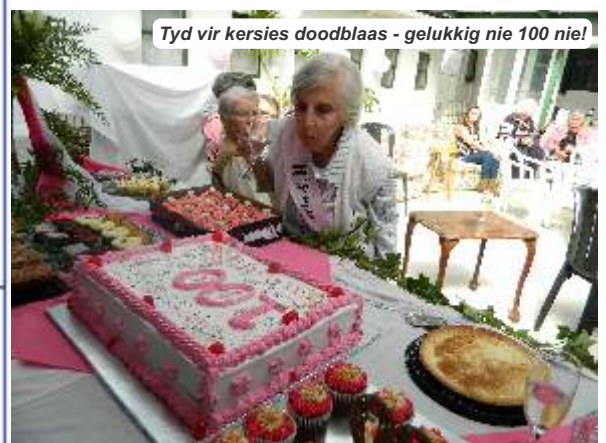
Tyd vir kersies doodblaas - gelukkig nie 100 nie!