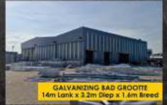
GALVANISERING S&D GROOITE 14m Lank x 3.2m Diep x 1.4m Breed

Diens beskikbaar in Gansbaai en omliggende dorpe - Skakel vandag nog of besoek galvatech.co.za