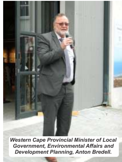
Western Cape Provincial Minister of Local Government, Environmental Affairs and Development Planning, Anton Bredell.

Some of the highlights were: A central tented gifts & goodies market on the Village Green; Garden exhibition with guest judges; Pop-up plant nursery; Hands-on gardening and creative workshops; Leivoor Lounge Wine, Spirits & Craft Beer bar on the Village Green;