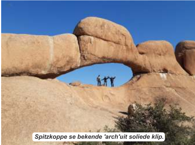
Spitzkoppe se bekende 'arch' uit soliede klip.