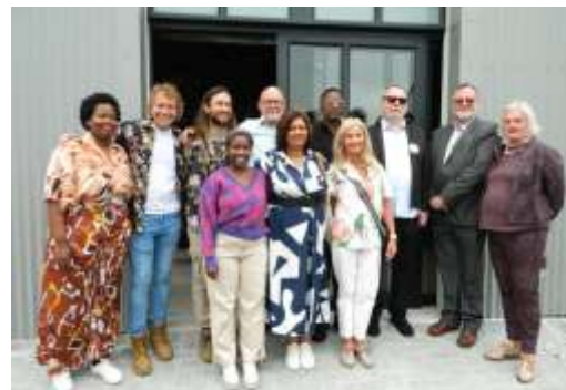
Rollplayers at the official opening of Stanford Chelsea.