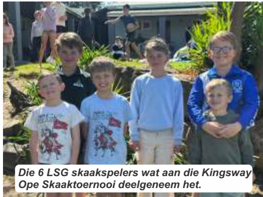
Die 6 LSG skaakspelers wat aan die Kingsway Ope Skaaktoernooi deelgeneem het.

Ses van Laerskool Gansbaai (LSG) se leerders het op Saterdag, 20 September 2025 aan die Kingsway Ope Skaaktoernooi deelgeneem en goed presteer.