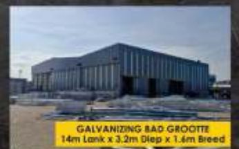
GALVANIZING BAD GROOTTE 14m Lank x 3,2m Diep x 1,4m Breed

Diens beskikbaar in Gansbaai en omliggende dorpe - Skakel vandag nog of besoek galvatech.co.za