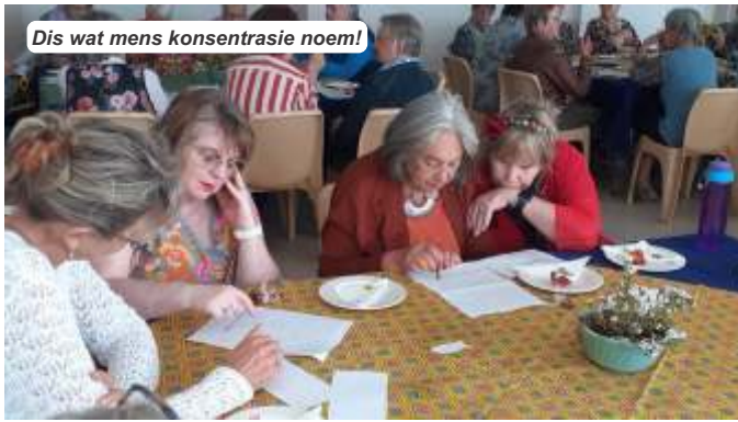
Dis wat mens konsentrasie noem!