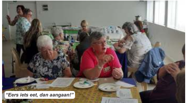
Eers iets eet, dan aangaan!