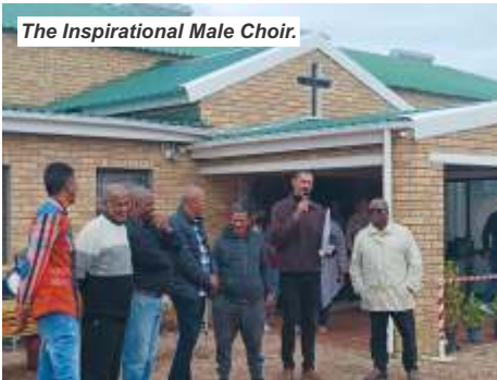
The Inspirational Male Choir.