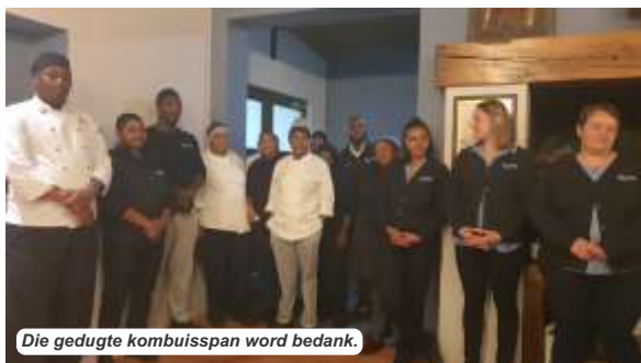
Die gedugte kombuisspan word bedank.

(verwelkomingswyn - 1977-wingerd); Noon Gun White Blend 2025 (Chenin, Sauvignon Blanc, Viognier) ; Free Run Sauvignon Blanc 2023 ; Paradigm Chenin Blanc (OVP) 2024 ; Longitude Red Blend (Shiraz, Cabernet Sauvignon, Malbec) ; Treaty Tree Red Classique 2022 (Cabernet Sauvignon, Merlot, Malbec, Petit Verdot) ; Writer's Block Pinotage 2021 ; Poetry Cinsault Rosé 2023 .