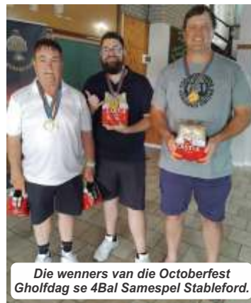
Die wenners van die Octoberfest Gholfdag se 4Bal Samespel Stableford.