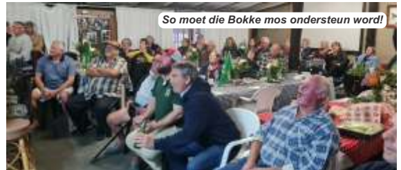
So moet die Bokke mos ondersteun word!