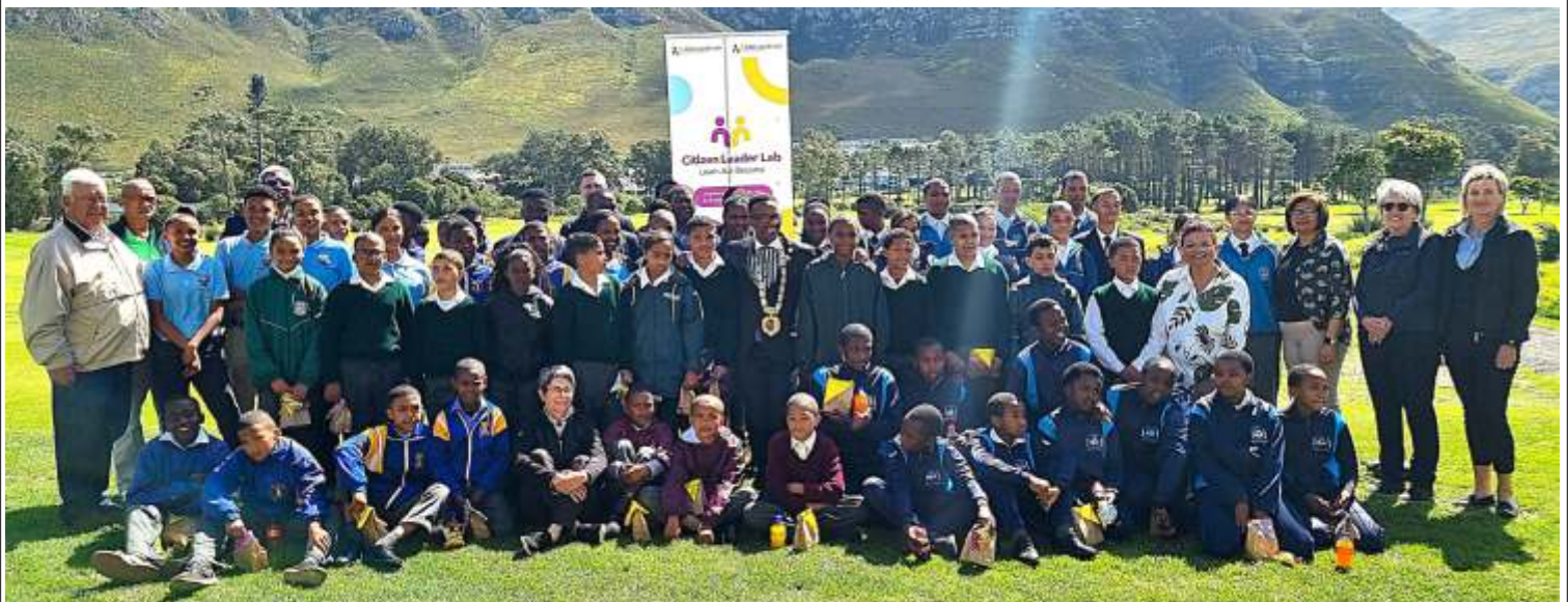
Group shot of attendees at the launch of the Junior Golf Academy