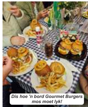
Dis hoe 'n bord Gourmet Burgers mos moet lyk!