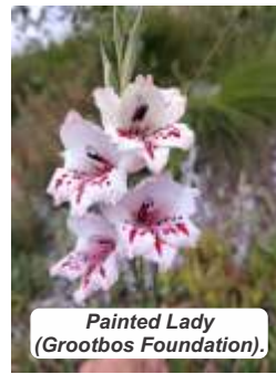
Painted Lady (Grootbos Foundation).