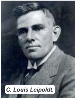
C. Louis Leipoldt.

Maar by ons is dit nie nét blomme nie - Oktober is ook Borskankermaand, met die jaarlikse Borskankerstep op Saterdag 11 Oktober 2025 vanaf 10:00, asook die bome in die dorp en omgewing wat pragtig met pienk "uitrustings"