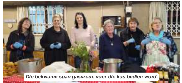
Die bekwame span gasvroue voor die kos bedien word.