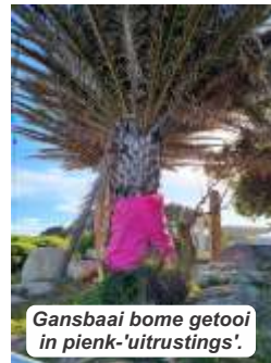
Gansbaai bome getooi in pienk-'uitrustings'.