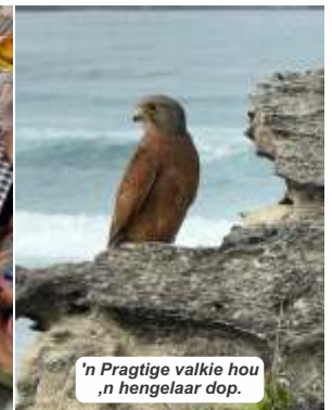
'n Pragtige valkie hou 'n hengelaar dop.