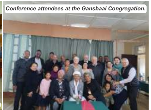
Conference attendees at the Gansbaai Congregation.