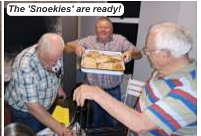
The 'Snoekies' are ready!