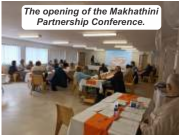
The opening of the Makhathini Partnership Conference.