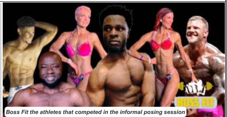
Boss Fit the athletes that competed in the informal posing session

Janine: 072 931 1431 janine@gansberg.co.za