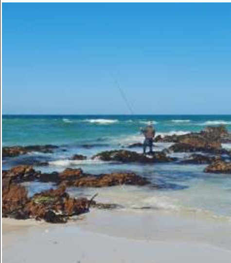
Ons wag en ons wag - 'n pragtige dag teen die see.