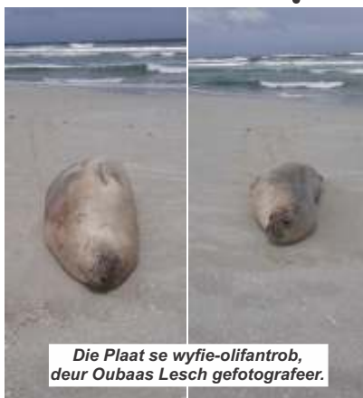
Die Plaat se wyfie-olifantrob.

Die suidelike olifantrob ( Mirounga leonina ) is een van twee spesies olifantrobbe. Dit is die grootste lid van die klade Pinnipedia en die orde Carnivora , en die grootste