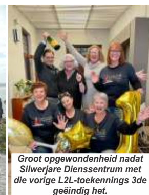
Groot opgewondenheid nadat Silwerjare Dienssentrum met die vorige L2L-toekennings 3de geëindig het.