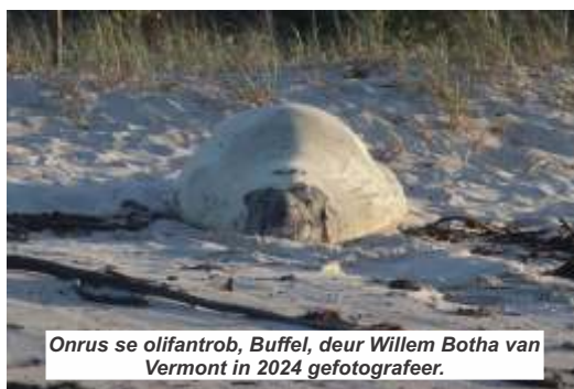
Onrus se olifantrob, Buffel, deur Willem Botha van Vermont in 2024 gefotografeer.

Die rekordgrootte bul, wat op 28 Februarie 1913 in Possessionbaai, Suid-Georgië, geskiet is, was 6,85 m lank en het sowat 5 000 kg geweeg. Die maksimum grootte van 'n wyfie is ongeveer 1 000 kg, met 'n lengte van 3,7 m. Hulle agterste ledemate is ongeskik vir beweging op land, daarom gebruik hulle hul vinne as ondersteuning om hul liggame aan te dryf. Hulle kan selfs so vinnig as 8 km/h vir kort afstande beweeg - om terug te keer na die water, om 'n wyfie in te haal of om 'n indringer te verjaag.