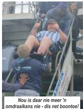
Nou is daar nie meer 'n omdraaikans nie - dis net boontoe!