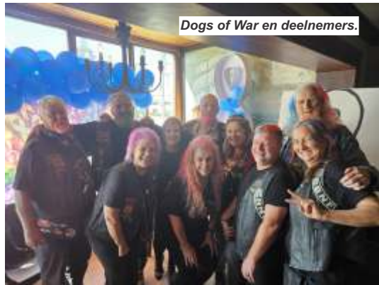
Dogs of War en deelnemers.