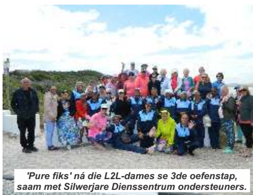
'Pure fiks' ná die L2L-dames se 3de oefenstap, saam met Silwerjare Dienssentrum ondersteuners.