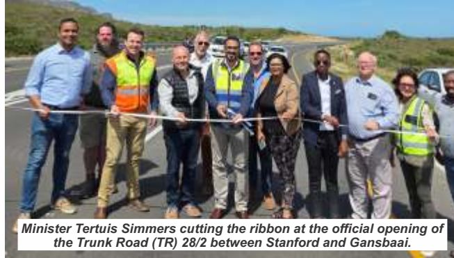
Minister Tertuis Simmers cutting the ribbon at the official opening of the Trunk Road (TR) 28/2 between Stanford and Gansbaai.

"Today we didn't just cut a ribbon - we celebrated a major investment in mobility, safety, and opportunity for the people of Stanford, Gansbaai, and the greater Overstrand area," said Western Cape Minister of Infrastructure, Tertuis Simmers, after officially opening the Trunk Road (TR) 28/2 between Stanford and Gansbaai on 21 October 2025. The Western Cape Department of Infrastructure (DOI) project involved upgrading and rehabilitating approximately 20km of Trunk Road (TR) 28/2 between Stanford and Gansbaai, as well as upgrading 3.8km of Minor Road 4017 (OP4017) from gravel to a surfaced road. The project was officially opened by Minister Simmers.