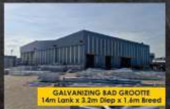
GALVANIZING S&D GROOTE 14m Lank x 3.2m Diep x 1.4m Breed

Diens beskikbaar in Gansbaai en omliggende dorpe - Skakel vandag nog of besoek galvatech.co.za