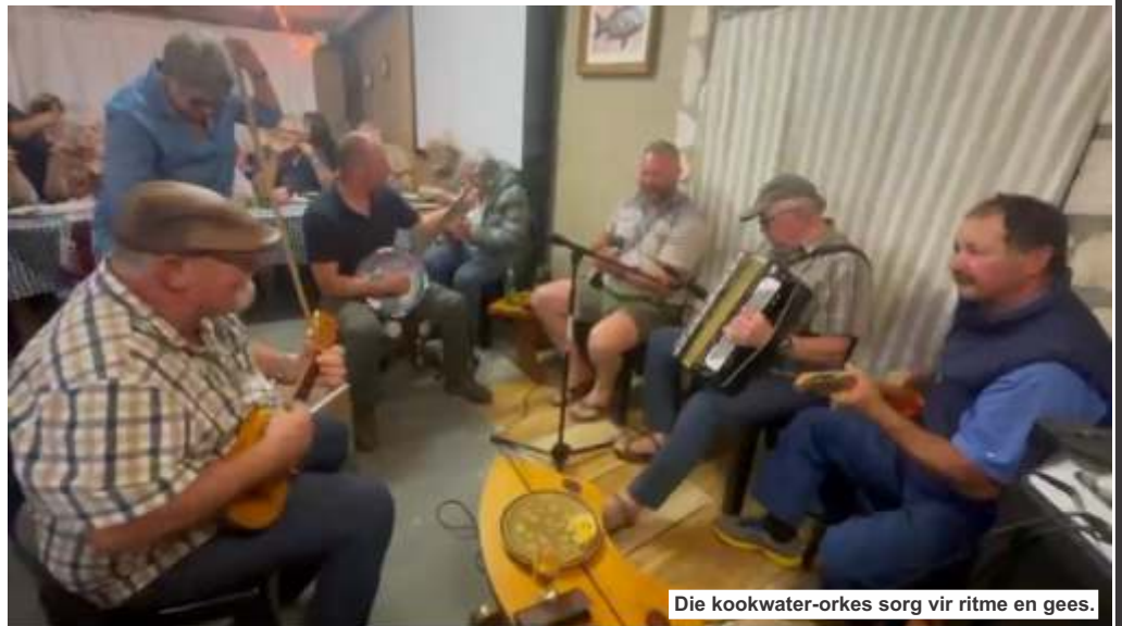
Die kookwater-orkes sorg vir ritme en gees.