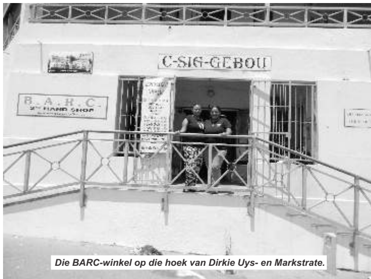
Die BARC-winkel op die hoek van Dirkie Uys- en Markstrate.