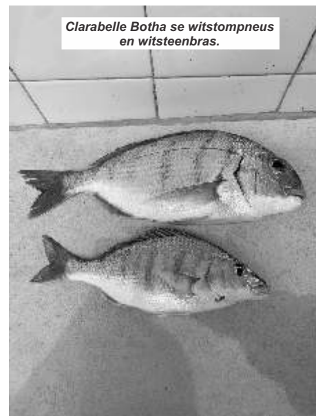
Clarabelle Botha se witstompneus en witsteenbras.