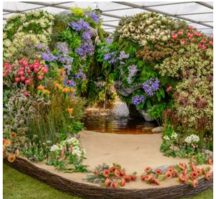
Grootbos Foundation's Chelsea Flowers in Stanford on 10 September 2025.