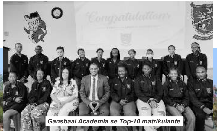
Gansbaai Academia se Top-10 matrikulante.