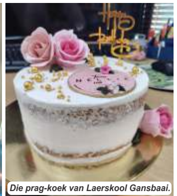
Die prag-koek van Laerskool Gansbaai.