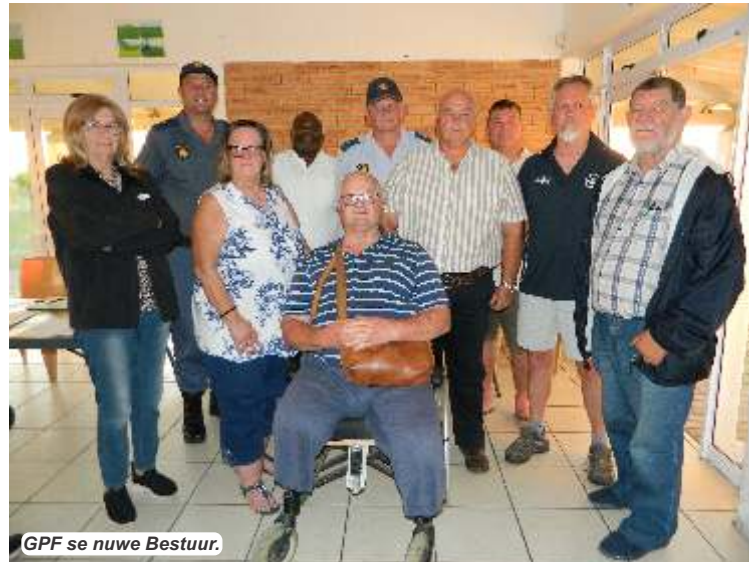
GPF se nuwe Bestuur.

Verloop van die vergadering Die waarnemende voorsitter,