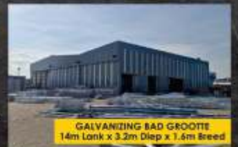
GALVANIZING BAD GROOTTE 14m Lank x 3.2m Diep x 1.6m Breed

Diens beskikbaar in Gansbaai en omliggende dorpe - Skakel vandag nog of besoek galvatech.co.za