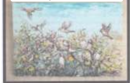
Mossies as metafoor van God se omgee - skildery deur Dani l Louw.

kortlys vir die Andrew Murray-prys geplaas - 'n ryklik geillustreerde werk, gegrond op dekades se navorsing oor menslike verplasing en 'n oproep tot optrede. Nou is Kaiings van wysheid bekendgestel - weer eens deur Naledi, 'n uitgewer wat in boekkringe geen bekendstelling nodig het nie.