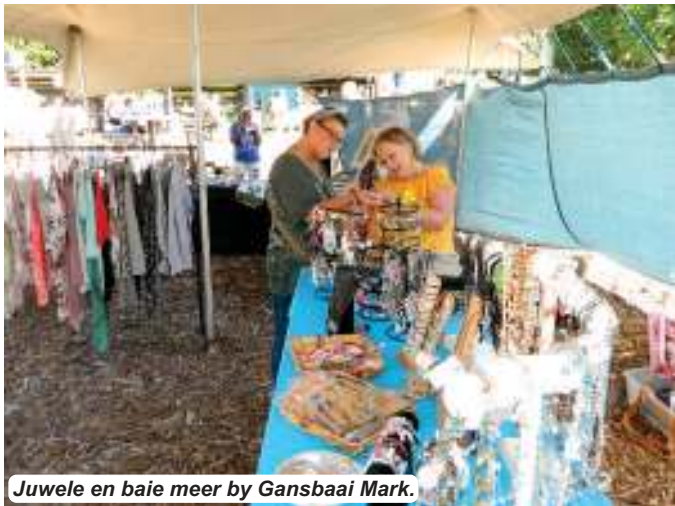
Juwele en baie meer by Gansbaai Mark.

Wat ons instansies en organisasies betref, was daar verskeie aktiwiteite wat vir besoekers aangebied is: 'n Paaseiersoektog by Saterdag se Gansbaai Mark; 'n prestige-kunsuitstalling, Déjà Vu , in Die Hangkas te Groeneweide; 'n familie-rolbaldag vir "leke" om 'n gesellige rolbaldag te geniet; Pearly Beach se kerkbasaar waar daar baie te ete, te drinke en te kope - maar terselfdertyd nie plek vir 'n muis nie; twee oorvol karavaanparke; Sien berigte met detail-info in die res van hierdie uitgawe - iets vir almal.