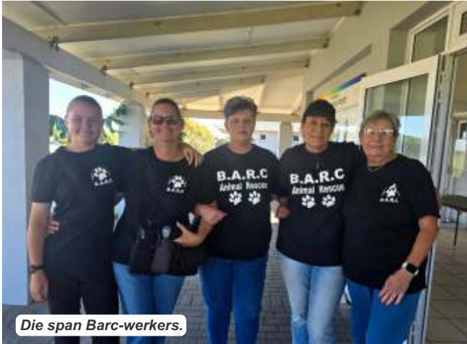
Die span Barc-werkers.