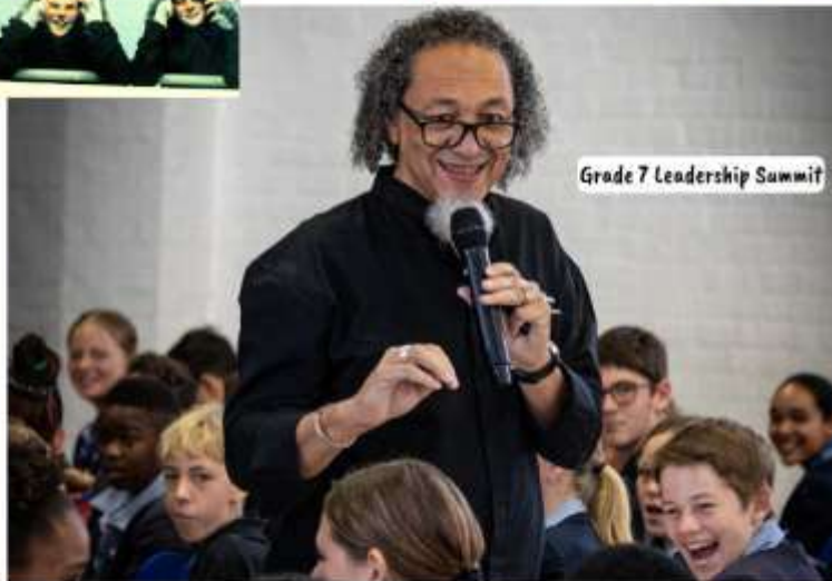
Grade 7 Leadership Summit