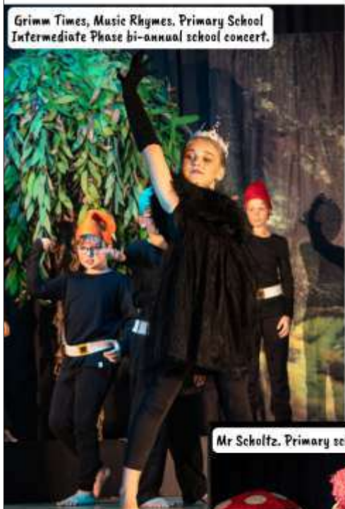
Grimm Times, Music Rhymes. Primary School Intermediate Phase bi-annual school concert.