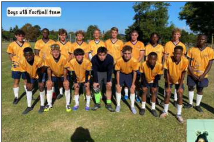
Boys u18 Football team