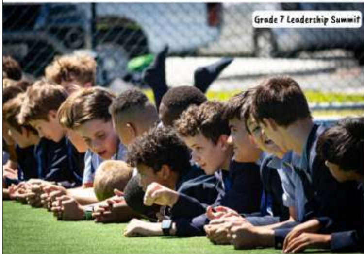
Grade 7 Leadership Summit