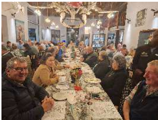
Die Great White House se gedugte span.