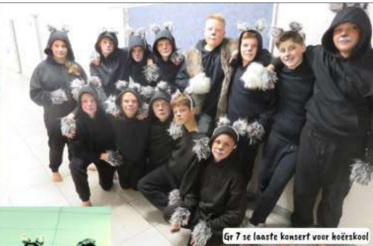
Gr 7 se laaste konsert voor hoërskool