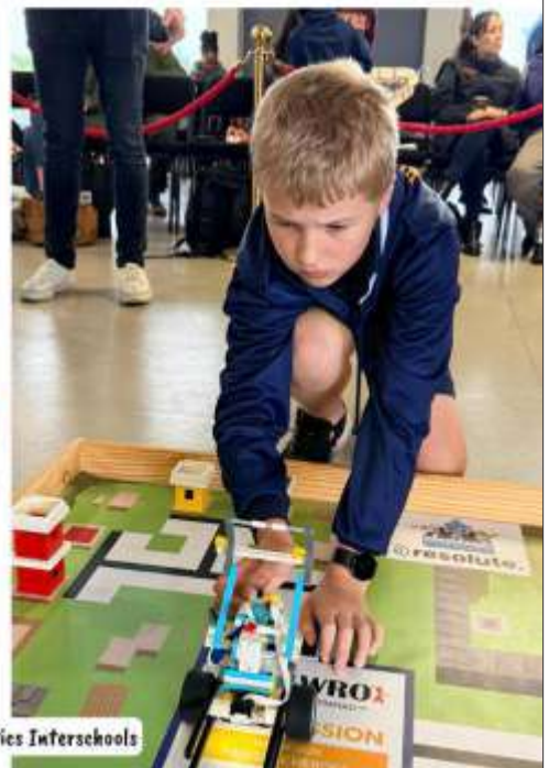
Grade 6 Robotics Interschools