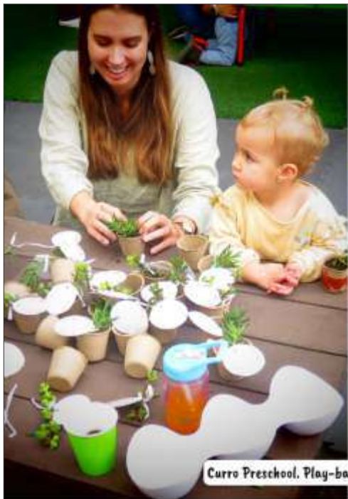
Curro Preschool. Play-based learning. Exploring from ages 4 month till 5 years. Grade R is part of the Primary School.