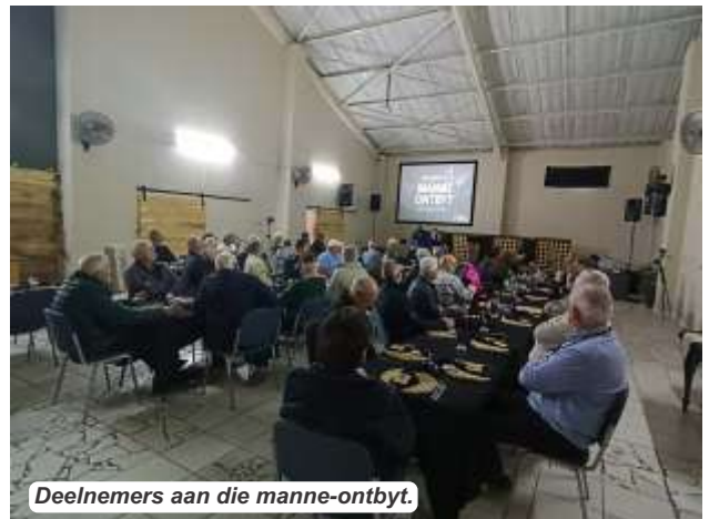
Deelnemers aan die manne-ontbyt.