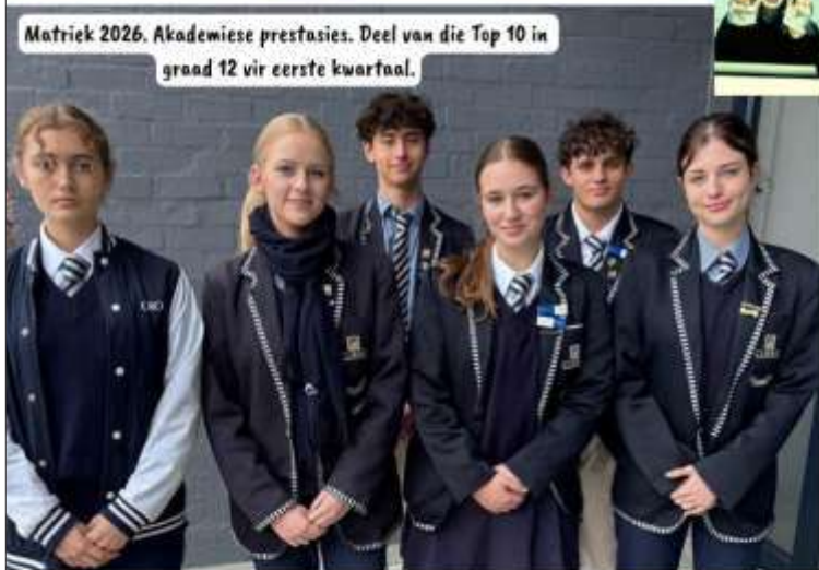
Matriek 2026. Akademiese prestasies. Deel van die Top 10 in graad 12 vir eerste kwartaal.