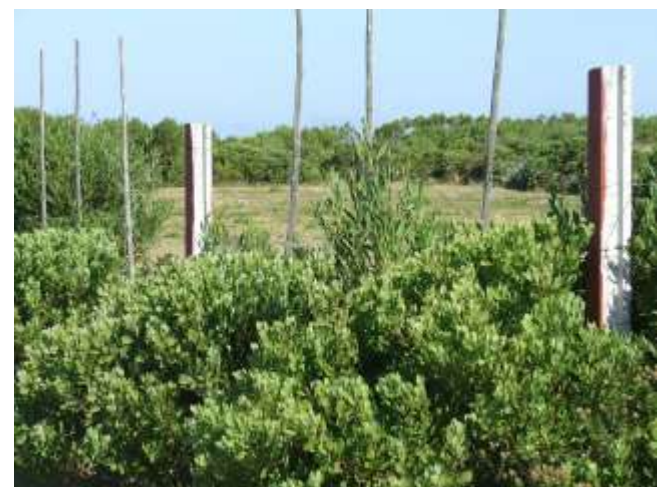
'n Deel van die heining wat blatant afgeruk en gesteel is.