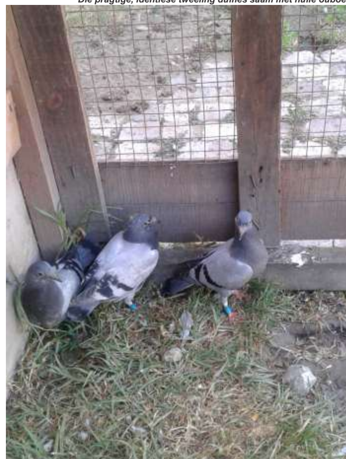
Die pragtige, identiese tweeling duifies saam met hulle ouboet.