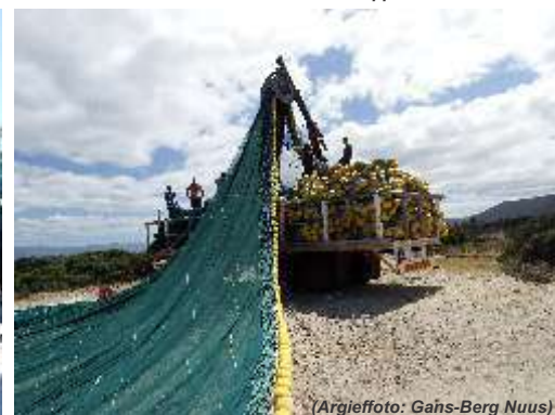
Die herstel (boot) van nette van die Silver Snapper.