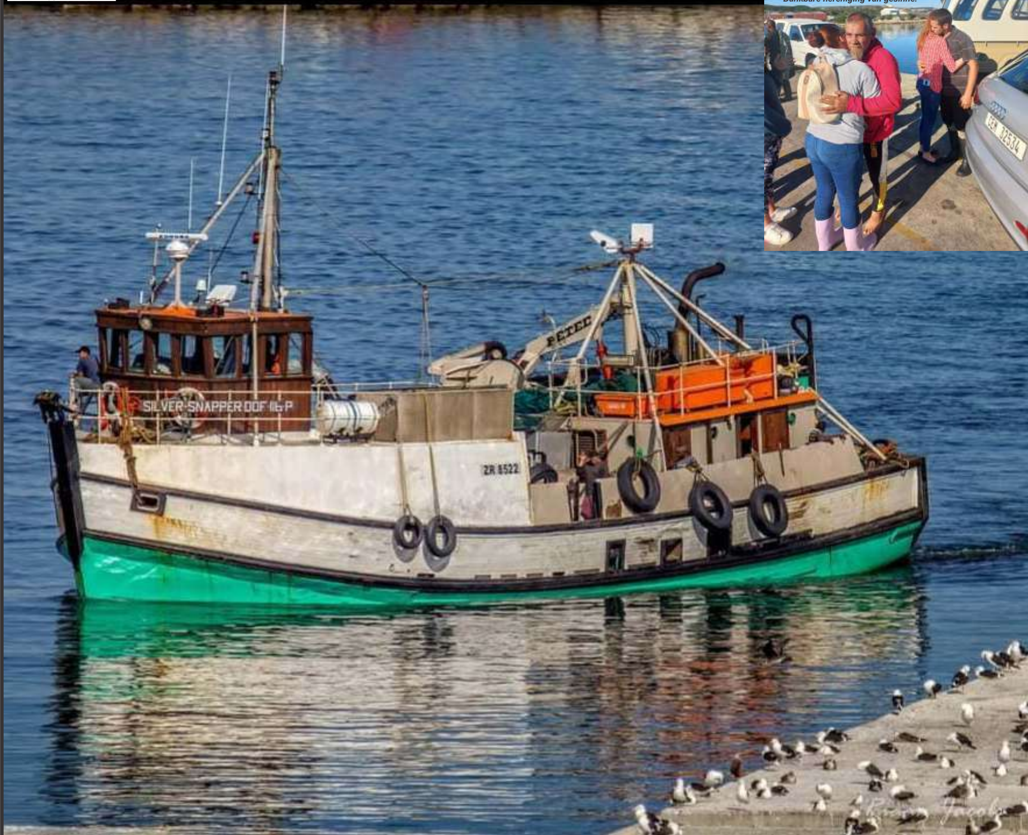
Dankbare hereniging van gesinne.