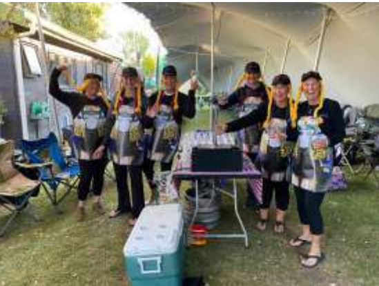
Committee all ready to serve ladies at the Beer Festival