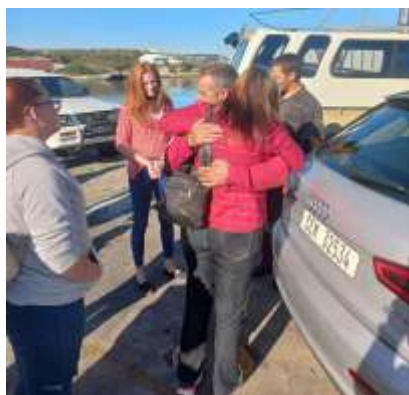
Dankbare hereniging van gesinne.