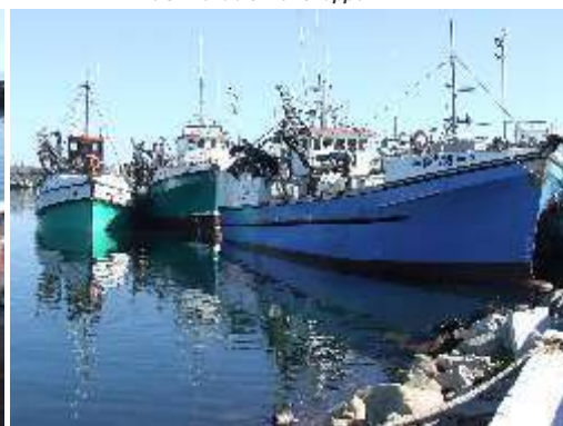
Silver Snapper sal gemis word.