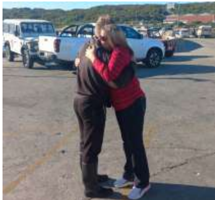
Dankbare hereniging van gesinne.