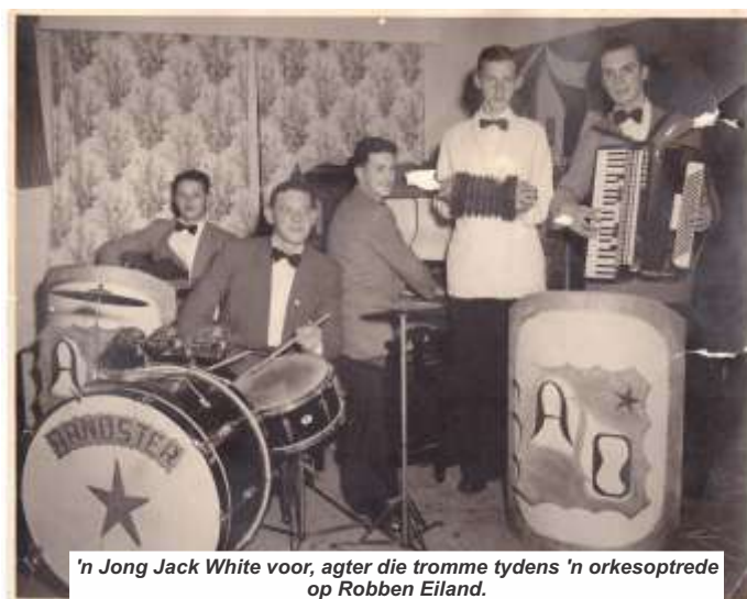
'n Jong Jack White voor, agter die tromme tydens 'n orkesoptrede op Robben Eiland.