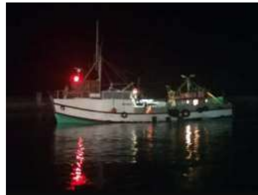
Die sinkende Silver Snapper.