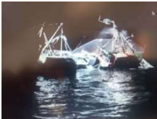
Die sinkende Silver Snapper.