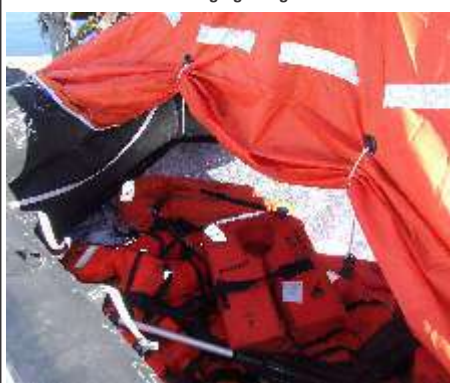
Die Viking Lewensreddingsboot in geheel en die bemanningslede se lewensreddingsbaadjies.