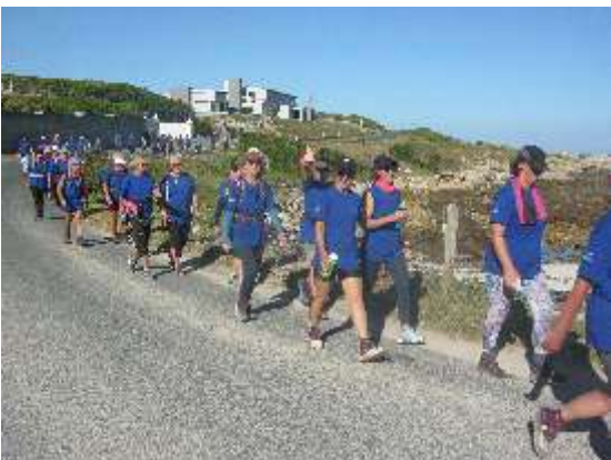
Ladies on their way to Danger Point Lighthouse