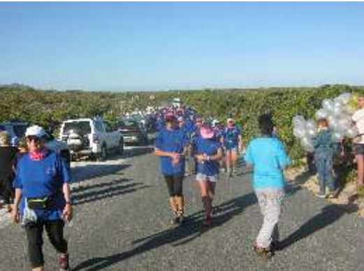
Ladies arriving at Danger Point Lighthouse