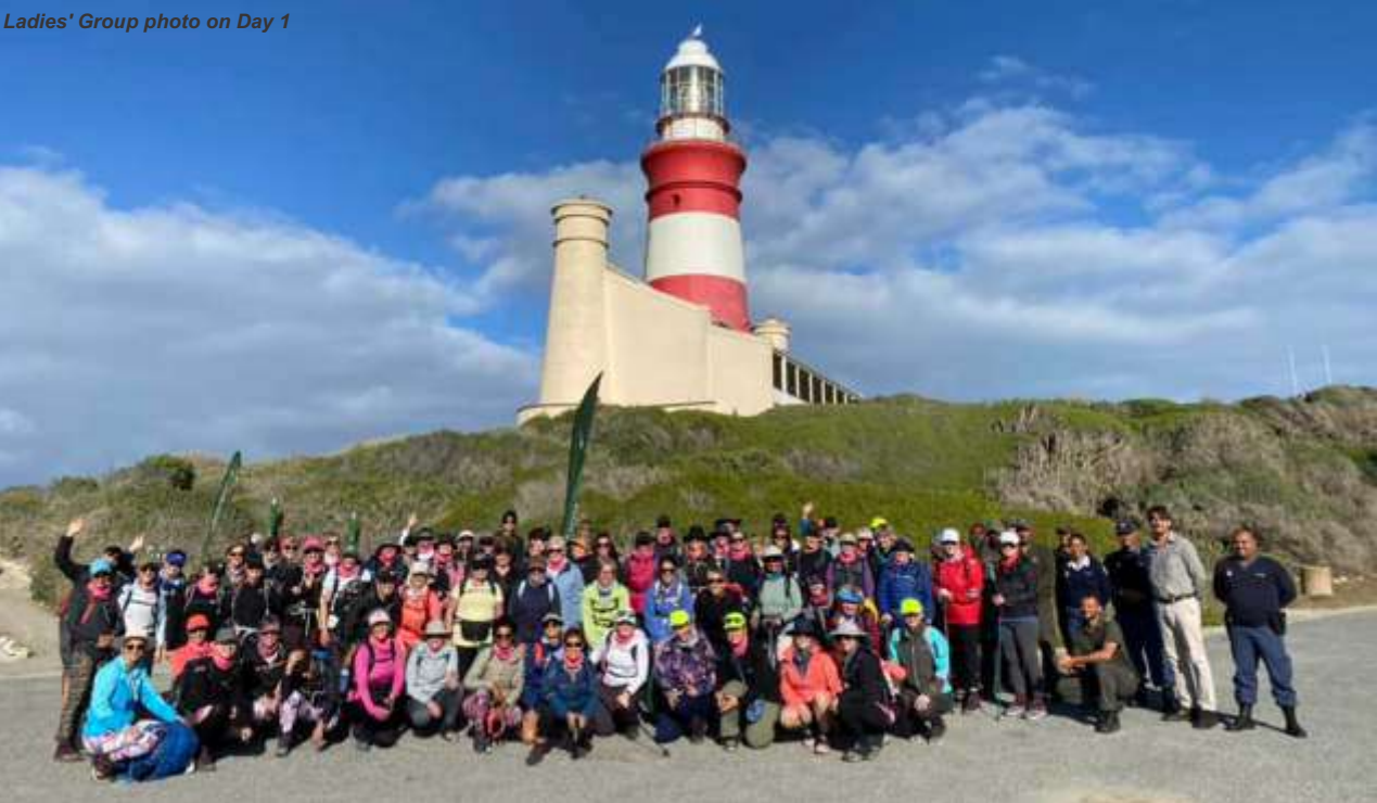
Ladies' Group photo on Day 1

normal water and Quoin did what he had to do – drink the water while in the ice cream container. Quoin's number is 37 and the Two Oceans Aquarium will keep them updated of his progress.