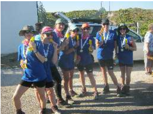
Ladies enjoying their ice lollies