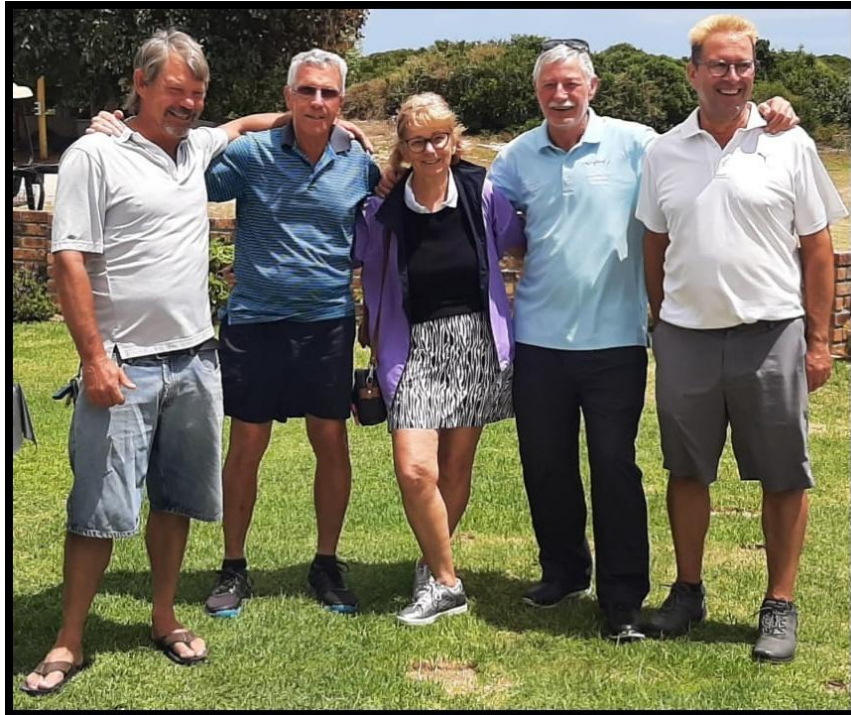
Sondagklub 24 Januarie 2023. Sunday Club 24 January 2023.