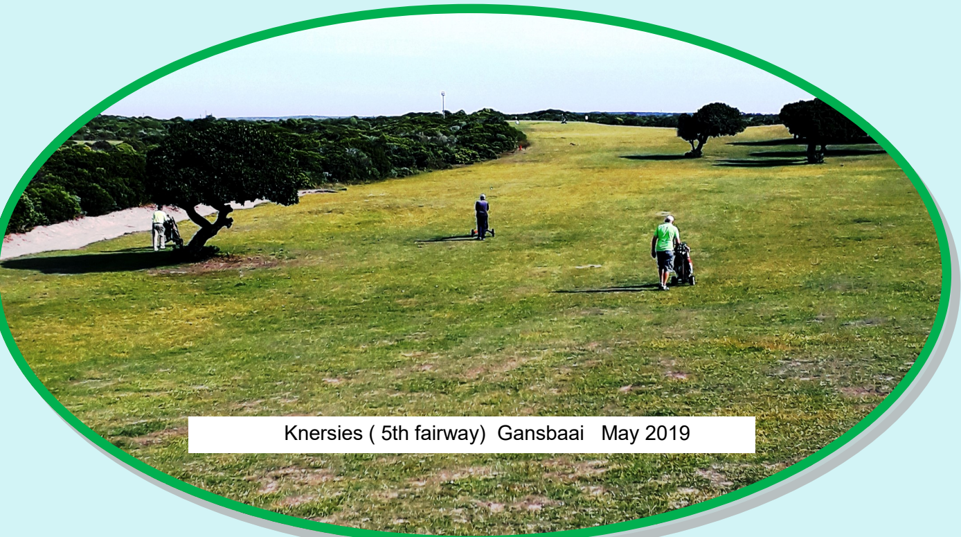
Knersies ( 5th fairway) Gansbaai May 2019

Mei het gekom en gegaan en ons bes bewaarde geheim van die lieflike winter gholfweer stel hierdie jaar weer nie teleur nie. Ons gholfbaan lyk pragtig en die setperke is die beste in die weste! Lees bladsy 4 indien jy ingelig wil bly oor die nuwe reëls op die horison ("wat"...sê jy... alweer"? ) Lekker gholf speel!