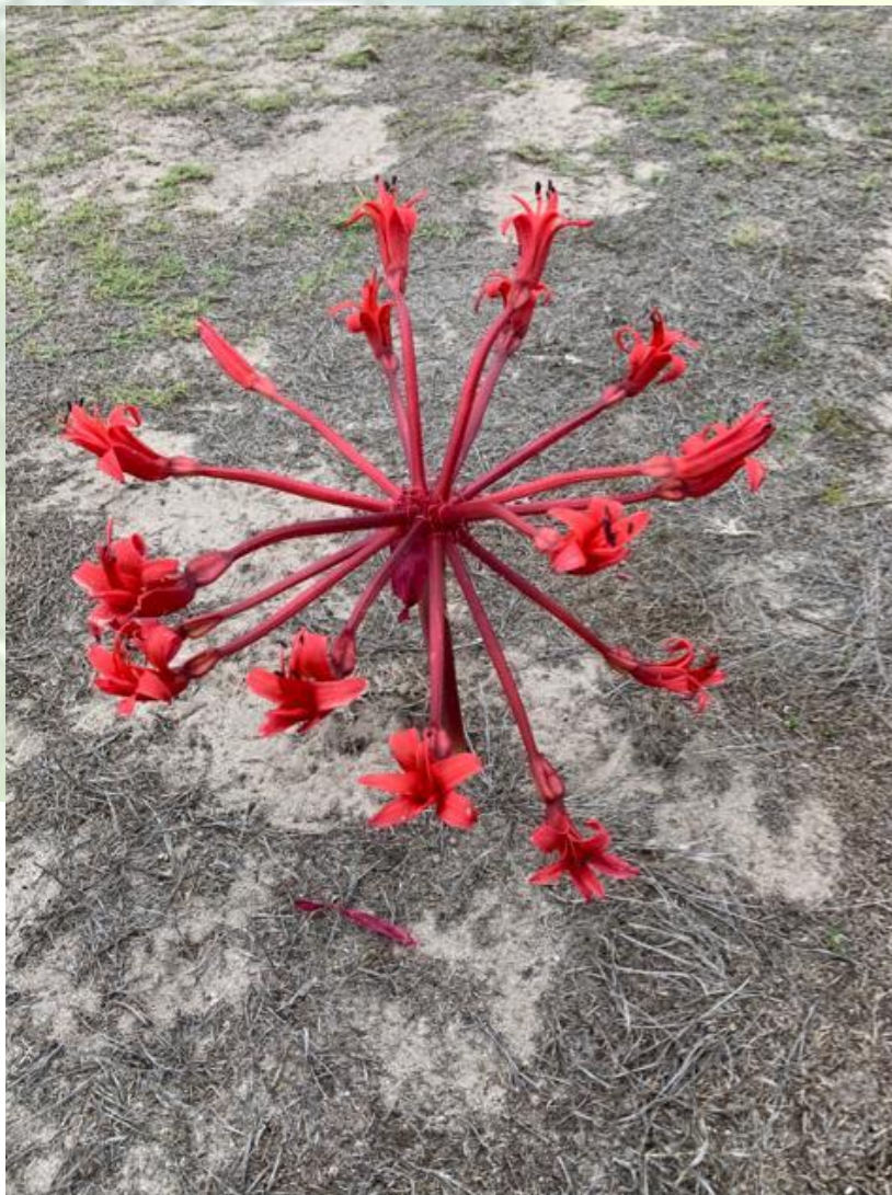
Kandelaarblom/Maartlelie – begin al blom!

Neem kennis asb: Gedurende die week van 8 – 12 Maart sal die gholfbaan gesluit wees sodat die setperke met 'n vurksnyer belug kan word.