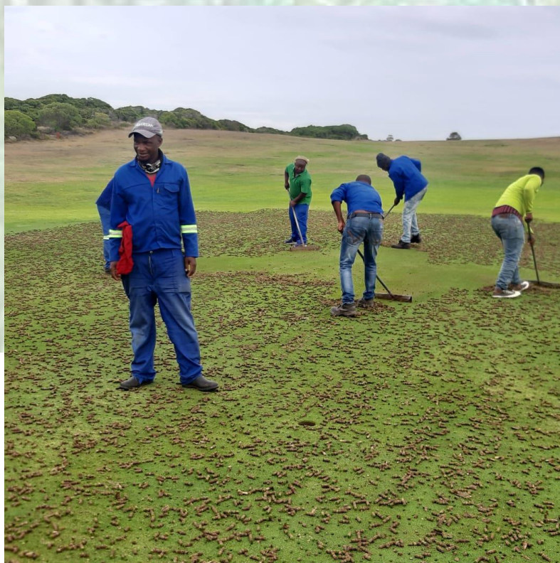
Workers busy with hollowtining process on a green