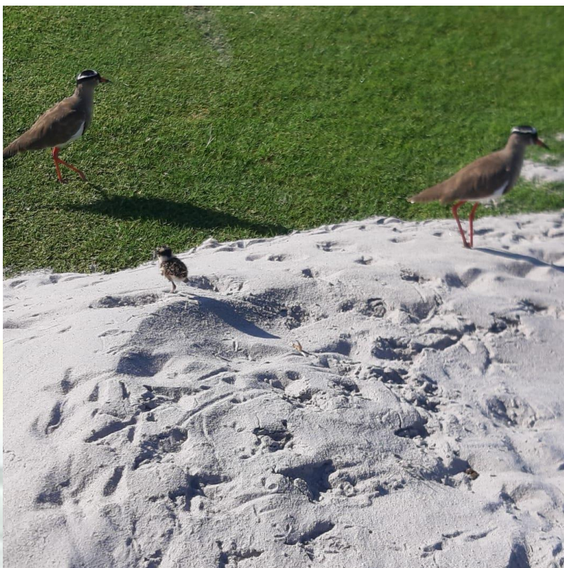
Kiewiete met piepklein kuikentjie