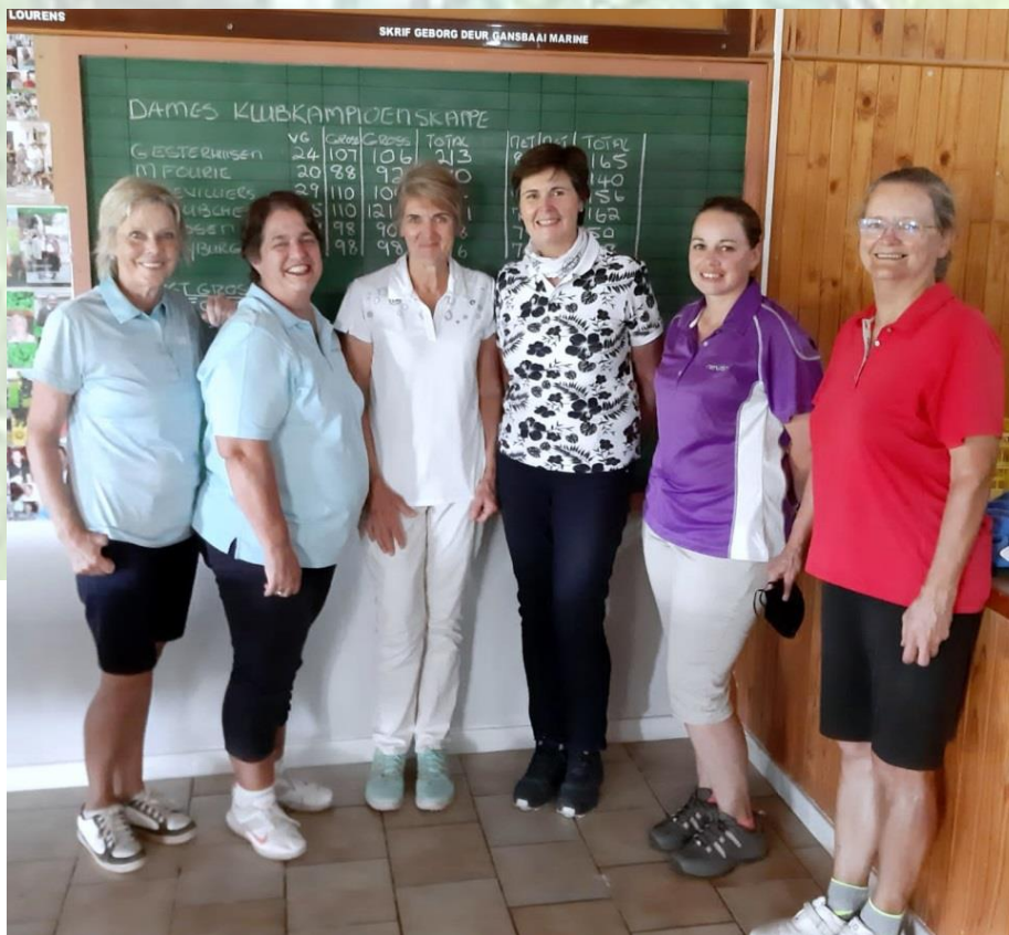
Participants: Ladies Club Championships / Deelnemers: Dames Klubkampioenskappe