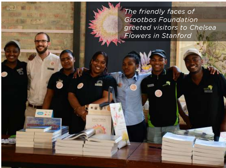
The friendly faces of Grootbos Foundation greeted visitors to Chelsea Flowers in Stanford