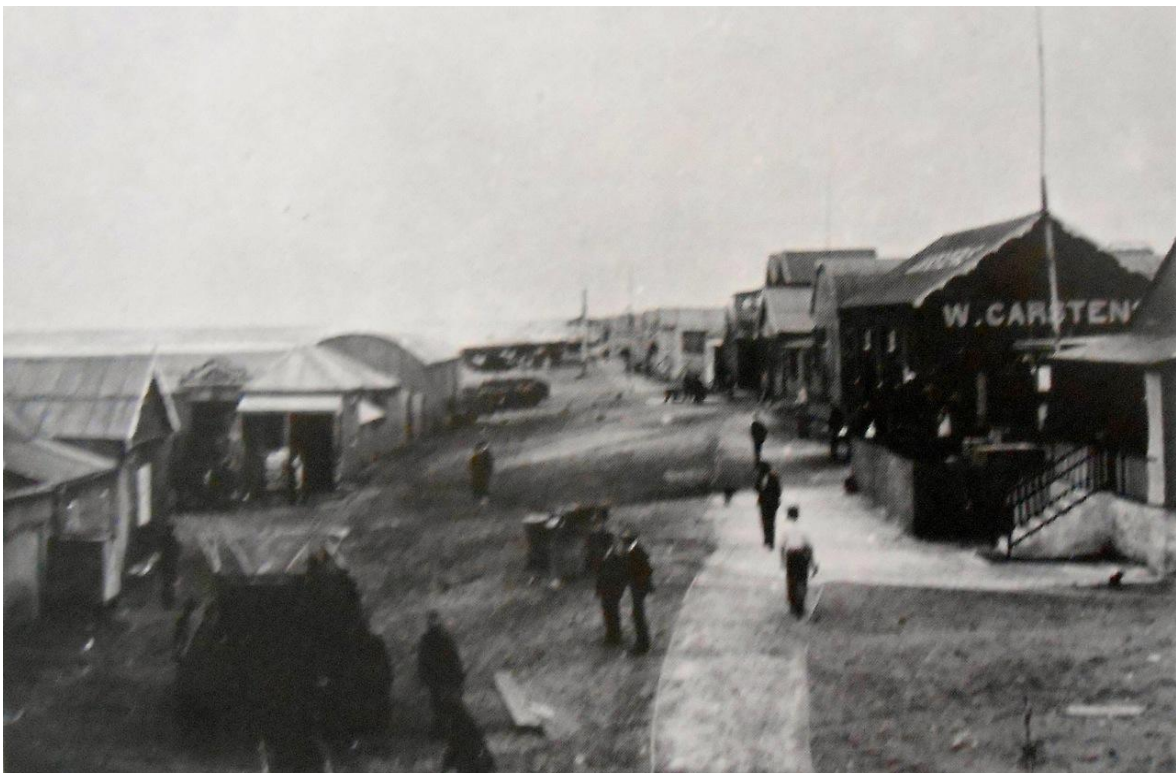
Port Nolloth ca. 1906: Civic Centre and Carstens Trading Store (looking north). At this point the town and harbour existed primarily due to its Copper shipping/export activities