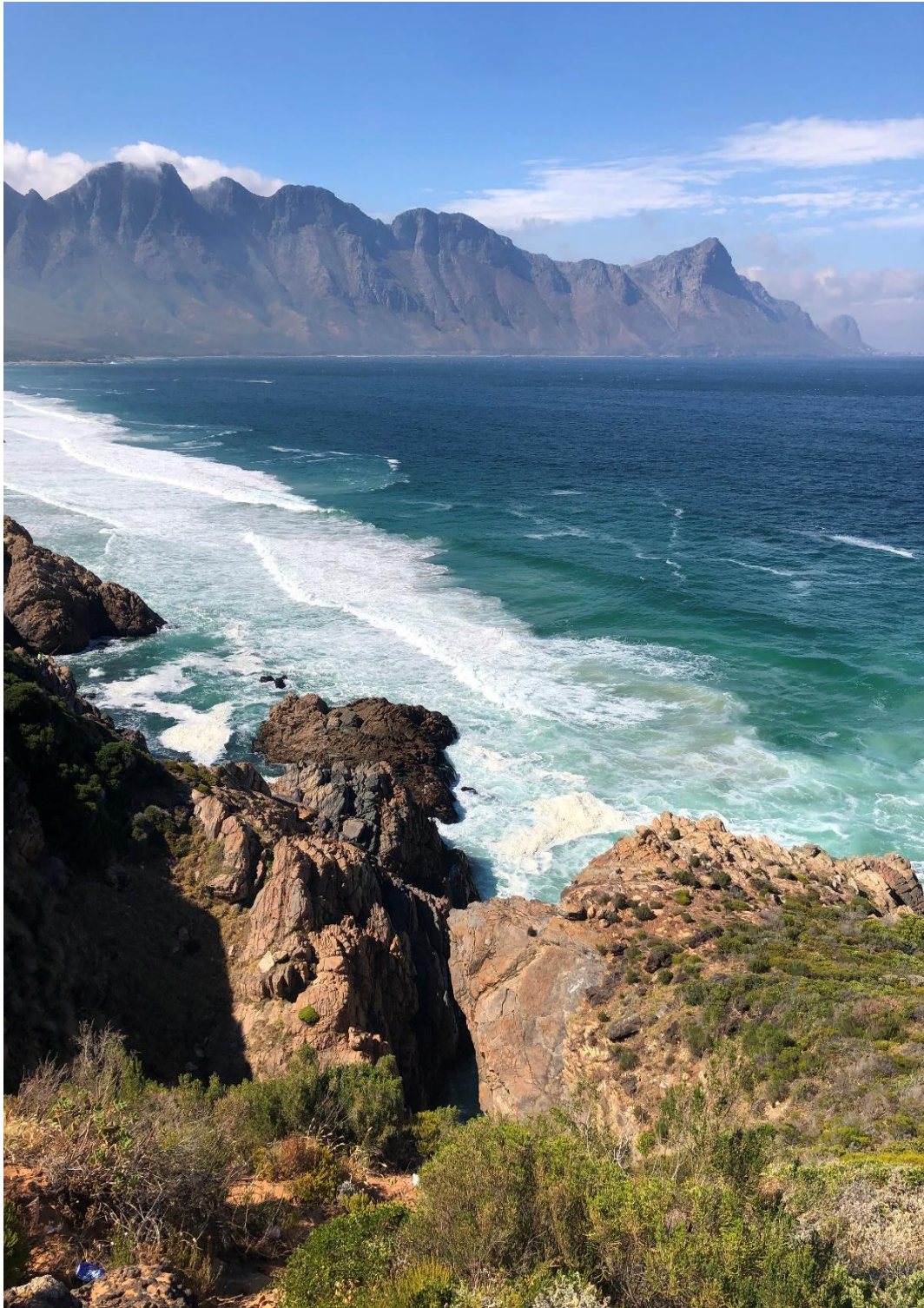
Kogelberg Mountains & Walker Bay from Clarence Drive. The highest mountain on the African shoreline (Koggelberg - 1,309 metres) is located on Clarence Drive (between Gordons Bay and Pringle Bay (southern Cape).