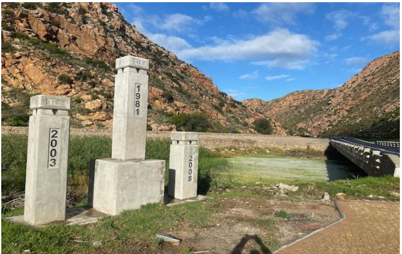
Kogmans Kloof Gorge with previous flood-height markers: 10 since 1867, including the 1981 flood that devastated Laingsberg on the N1 between Cape Town and Johannesburg