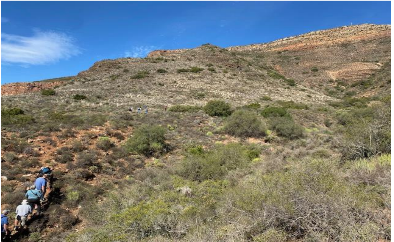
The Goedemoed olivine-melilitite (~62Ma) outcrop on Elandsberg Mountain slope (south-side of Van Lorens Wine Farm) with columnar jointing due to contraction of the cooling magma