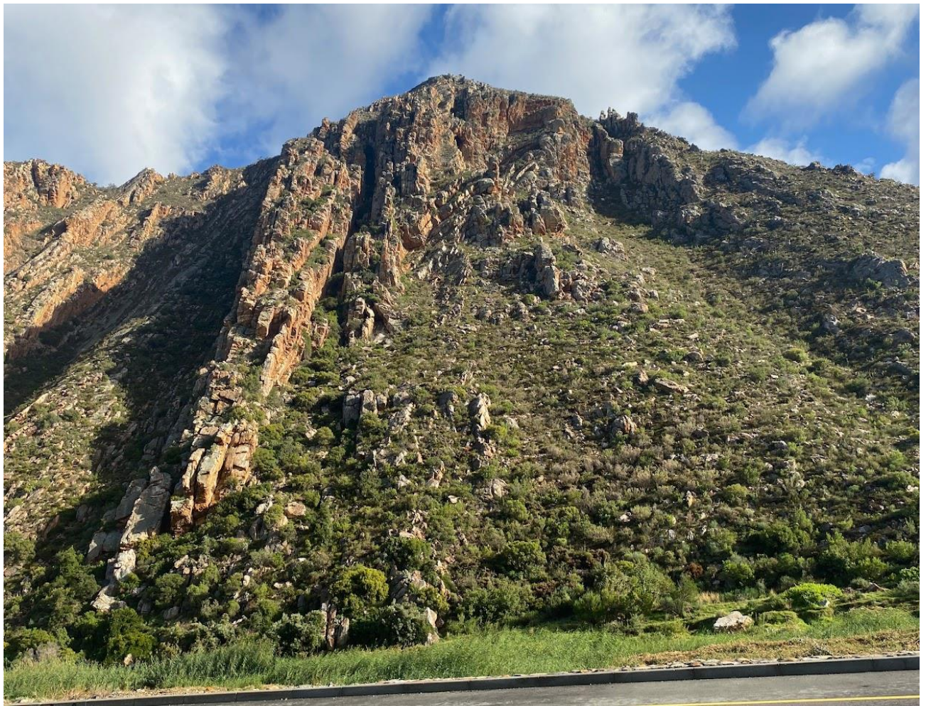
Steeply dipping, tightly folded TMS strata in Kogmans Kloof