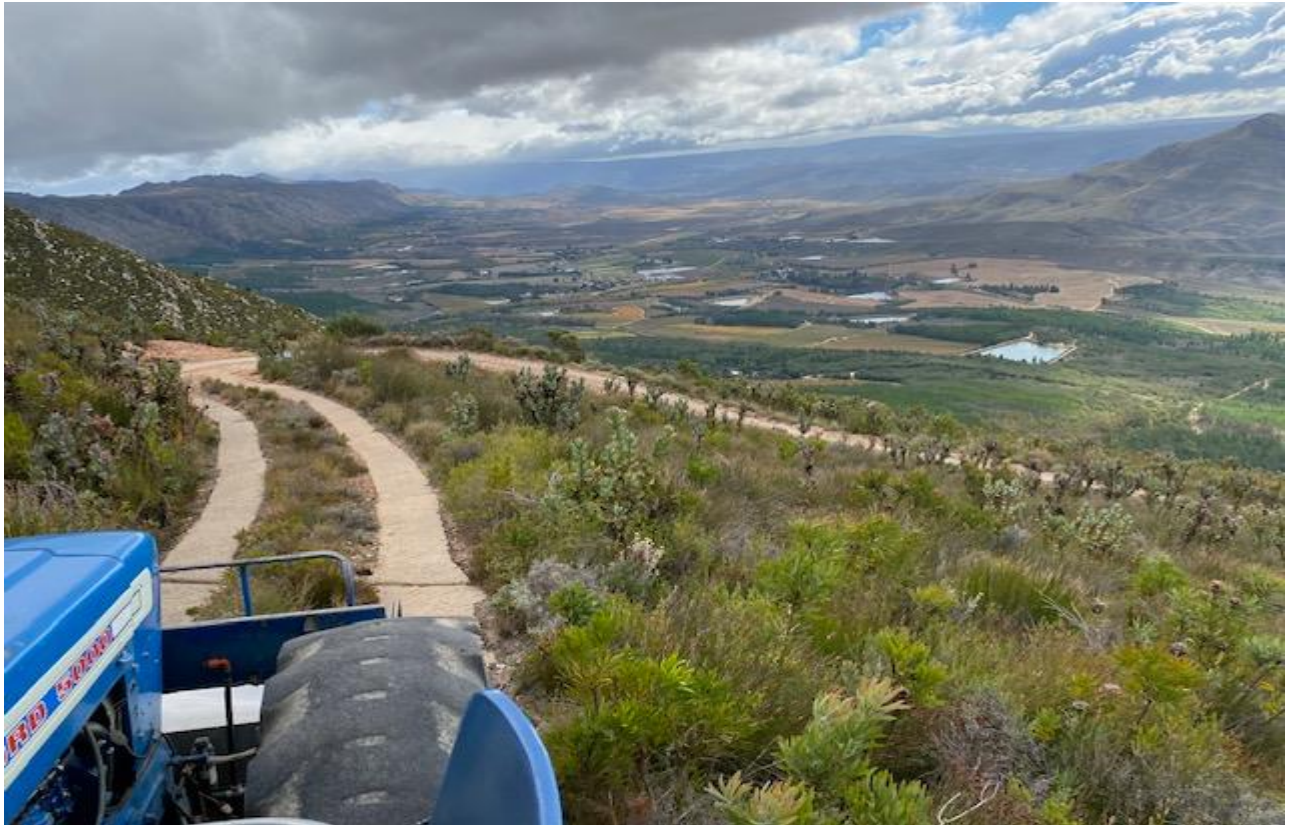
The KOO Valley to the north-west of Arangieskop