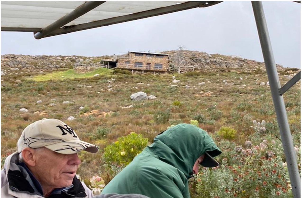
The Stone Cottage (1 405 metres) adjacent to Arangieskop on the Dassieshoek Nature Reserve, above Protea Farm