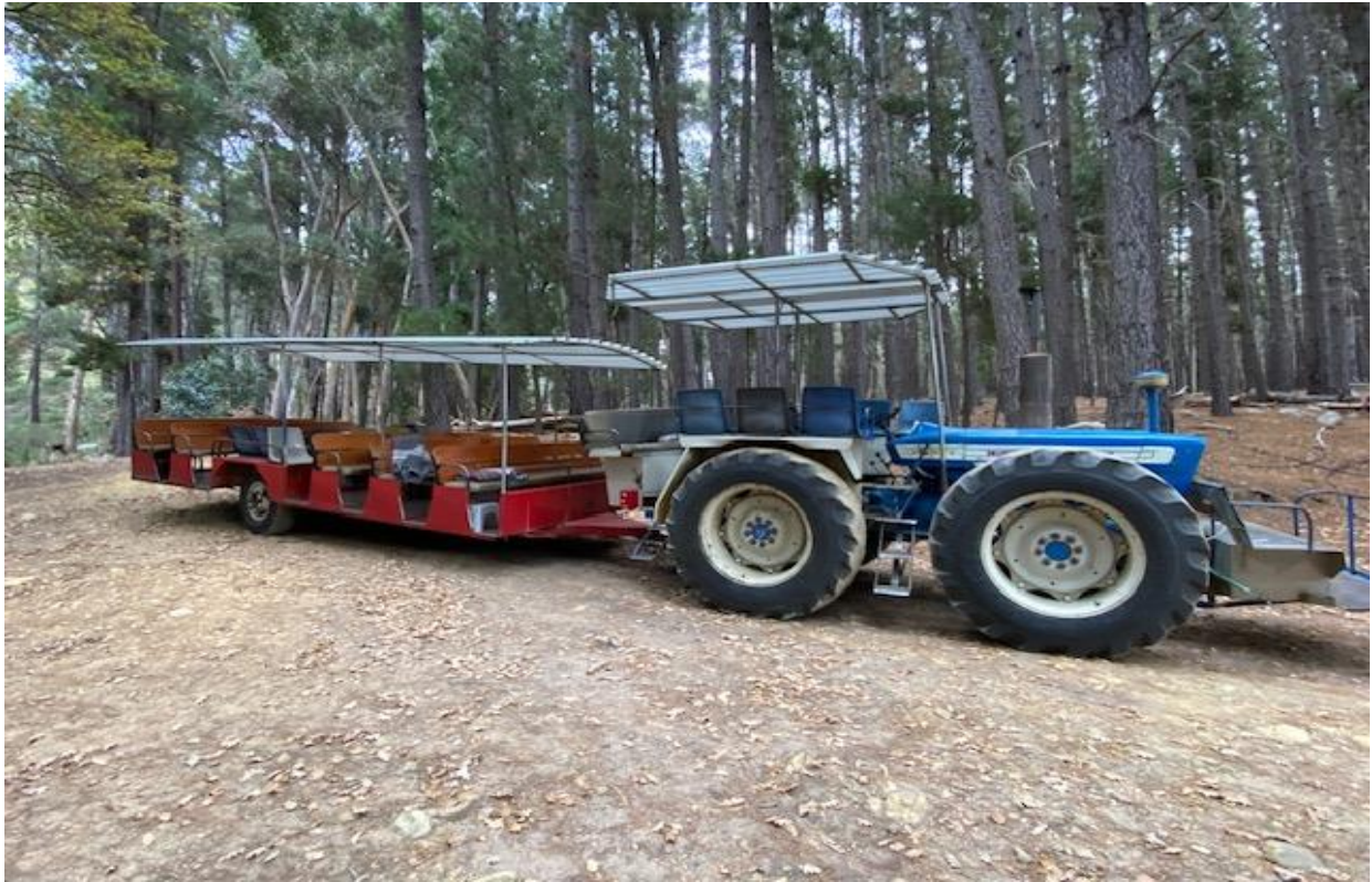
Protea Farm mode of transport for the ascent to the Dassieshoek Nature Reserve, Stone Cottage and Arangieskop Mountain