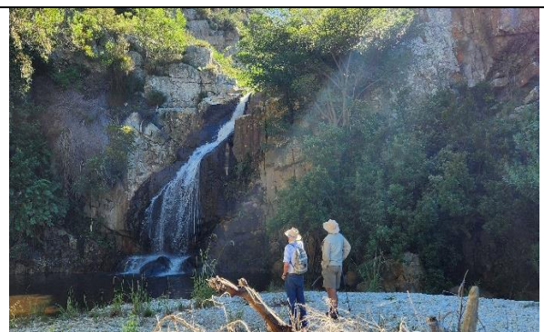
A Nick point. Waterfall at Volmoed