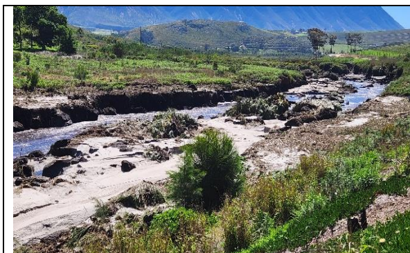
Erosion damaged caused to the Lower Onrus Peatbed