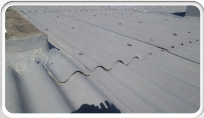
MISALIGNED ROOF SHEETS – BIG GAPS CRACKED AND LOOSE 'LAP EN PAP' LENGTH CRACKS IN VARIOUS PLACES