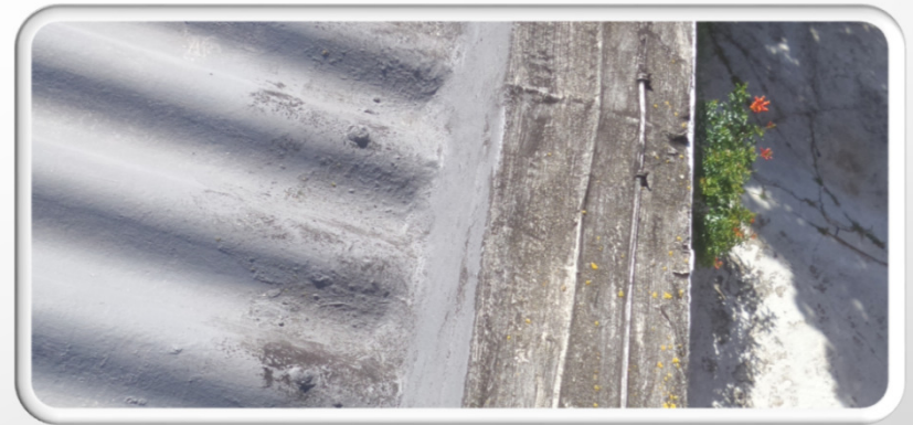
ROOF PAINT AND LAP – DRIED OUT AND CRACKED OR BUBBLING, ALSO LOOSE IN PLACES