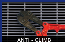
ANTI - CLIMB