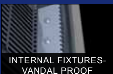
INTERNAL FIXTURES- VANDAL PROOF