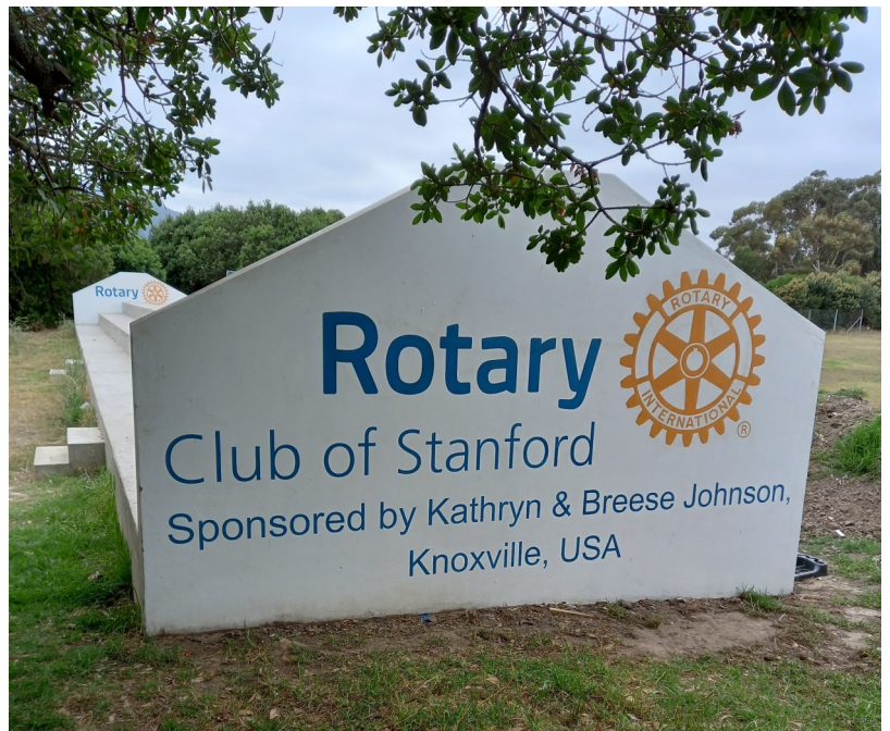
Final stage—signwriting and acknowledgement of sponsors

Should you wish to know more about any of our projects, or would like to contribute in any way, please contact Lana on 082 216 4398