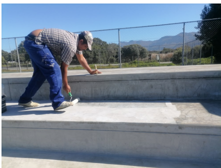
Sealing the plasterwork