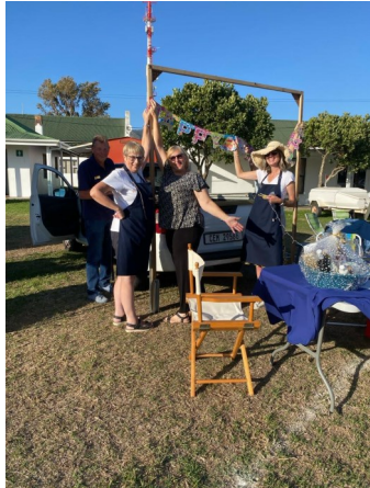
Rotarians having fun!

We take great pride in putting together the raffle hampers each month and strive to make them interesting and varied. For this we do ask for donations of home-made jams, pickles, marmalades, gift vouchers, beauty treats, hand-made items and so on from our very talented locals. We'll happily accept unwanted gifts as well. Please let us know if you have something you'd like to include.